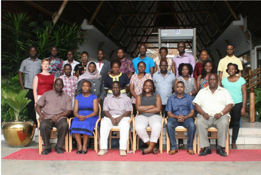
Photo: CAK members with other State agencies' officials during a retreat in Mombasa to discuss the repeal of Cap 222 on the Films and Stage Act.

In executing its mandate as espoused in the Competition Act No. 12 of 2010 (the Act), the Authority's engagement with its stakeholders is not only focused on relating with the public and communicating information, but also engaging them to inform policy directions. It's on this basis that the Authority participated in key stakeholder forums to deliberate on policy issues in the formulation of the National Investment Policy – a process spearheaded by Kenya Investment Authority (KenInvest).