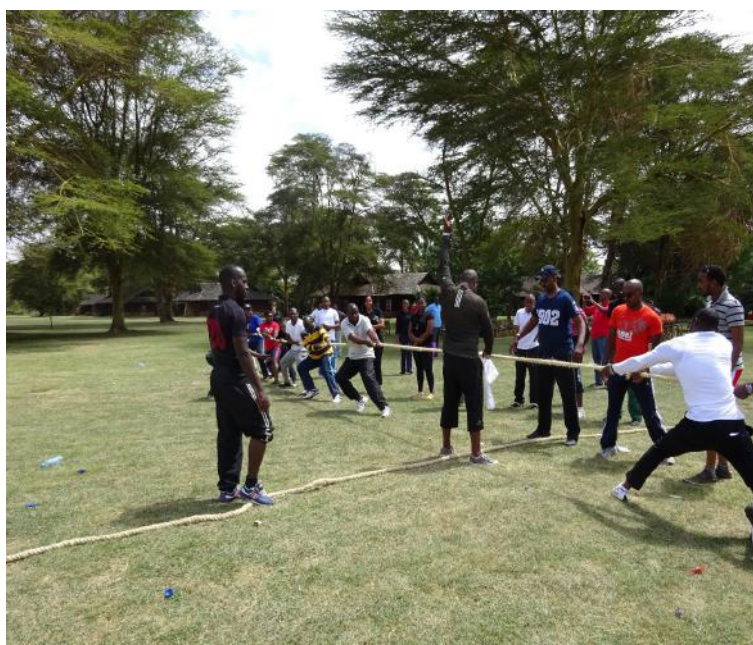
The Authority's staff in tag of war action during a team building activity

Is personal finance management a challenge to you? Are you ready or are you preparing for retirement? The team was educated on planning