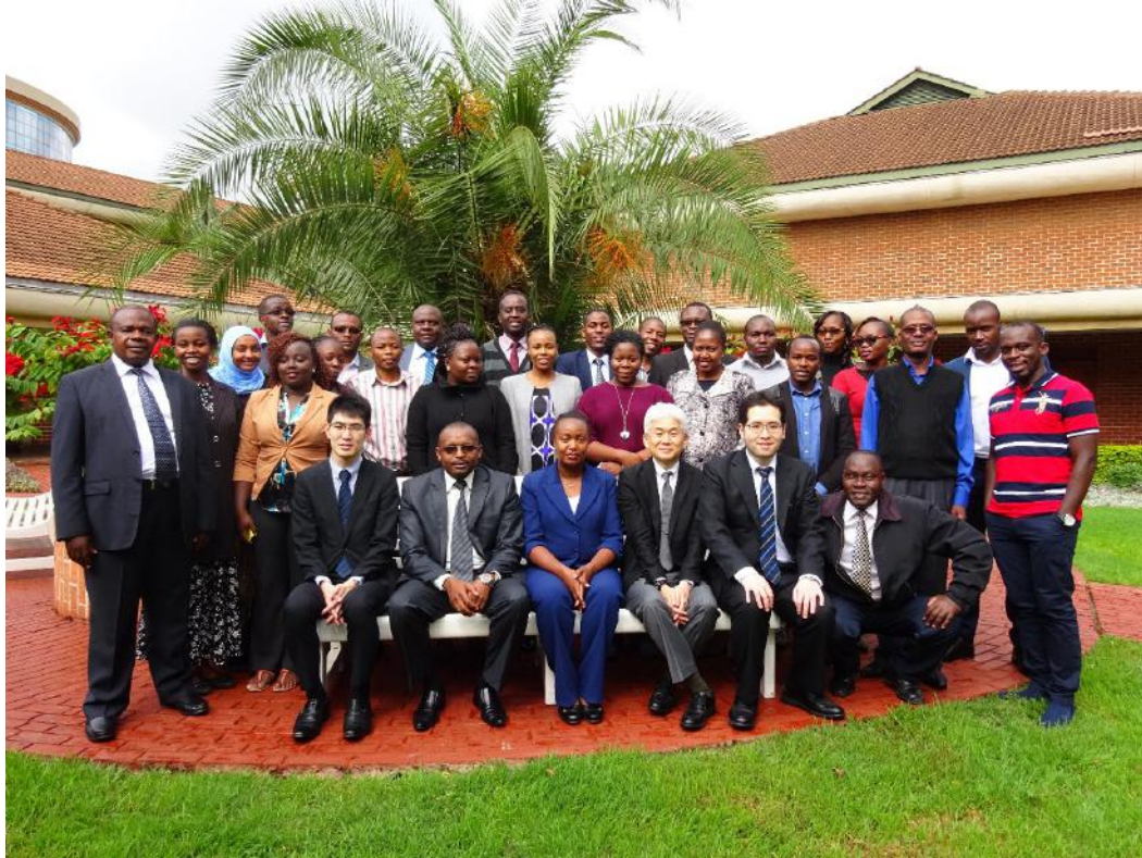
The Authority's Staff join the JFTC team for a photo session during the training at the Kenya School of Monetary Studies in Nairobi

Additionally, the JFTC facilitated a meeting between JICA/JFTC and the Authority officers. At the meeting, the progress of implementation of the JFTC/CAK MOU was discussed. Further, the meeting identified the next steps in the cooperation framework which will focus on enhancing the skills of the Authority staff through specialized trainings on competition.